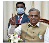
COVID vaccination. He further said that people respect religious leaders and in view of such importance, religious leaders should encourage people to come out for vaccination. Gov-

are the means available to fight the pandemic. Expressing concern over the low coverage of COVID vaccination mostly in the hill districts, La Ganesan said, in this critical juncture, all stakeholders including various religious and local leaders have to play a major role in reaching out to the people about the benefits of